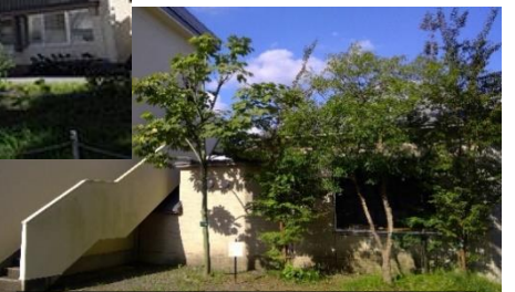
This is a memorial tree, aogiri .