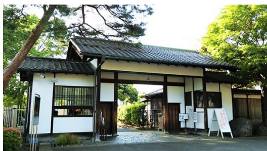
There are cats by the school gate, Sukiya-mon .