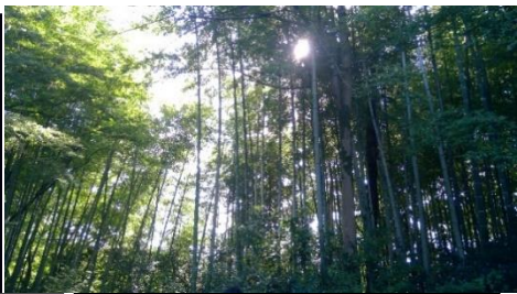
There are tall bamboo trees.