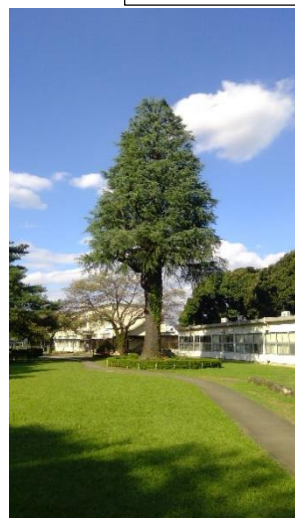
There are many trees.