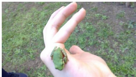
There are frogs in the grass.