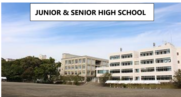
JUNIOR & SENIOR HIGH SCHOOL