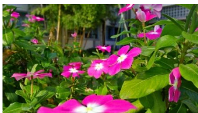
There are many flowers.