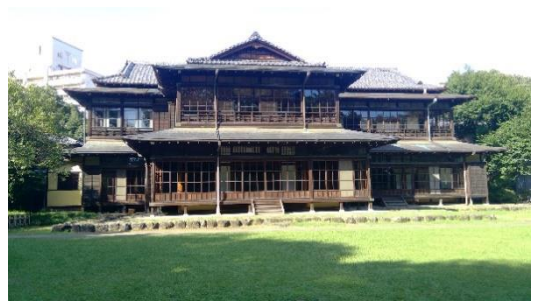
There is a very old big building, Hokusenryo .