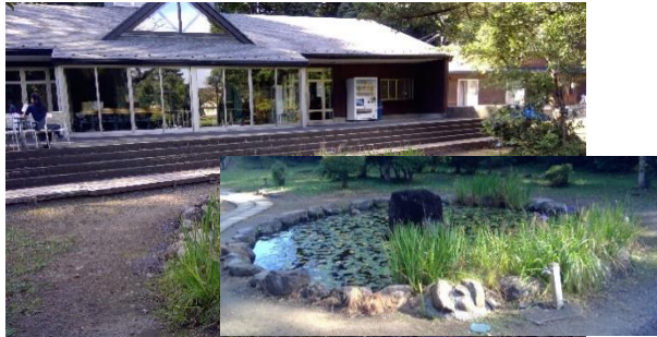
There is a small crayfish pond.