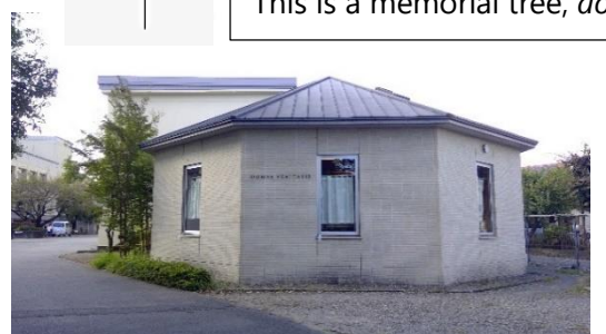
There is a hexagonal library.