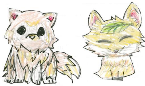
There are foxes and raccoon dogs in the forest.