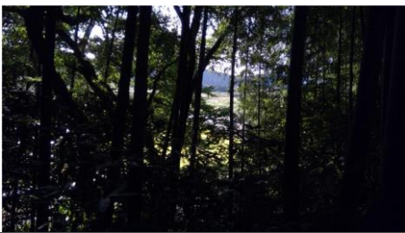
We can see Tama river but it's tiny from here.