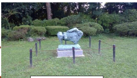
There is a statue.