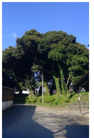
This tree looks like broccoli.